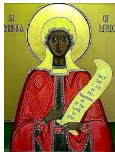
St. Monica - made sacrifices for others