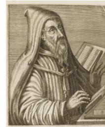
St. Augustine - fed poor and hungry people