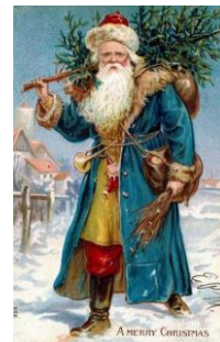
St. Nicholas - gave gifts to poor children