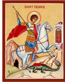
St. George - the patron saint of England

Saints are very special to Christians. They do kind things for other people and are very close to God.