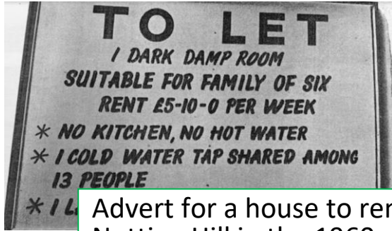
Advert for a house to rent in Notting Hill in the 1960s.